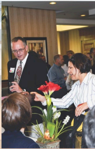
Above: Checking in at the Wyndham.